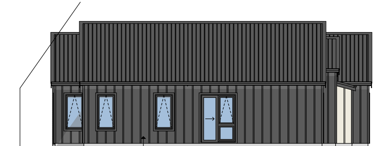
ELEVATION 2 (WESTERN)

H3.1 PLY BOARD & BATTEN CLADDING ON 20mm VENTED CAVITY SYSTEM (BATTENS @ 400 CRS)