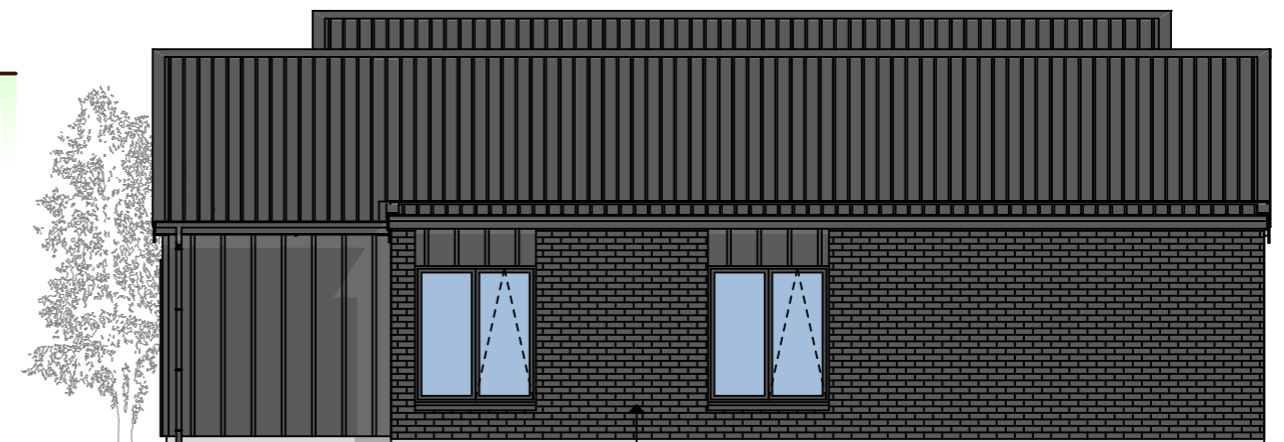
ELEVATION 4 (EASTERN)

70 SERIES CLAY BRICK VENEER EXTERIOR CLADDING