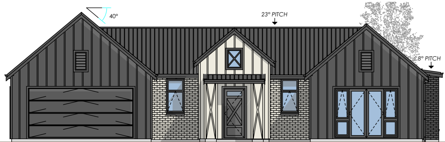
ELEVATION 1 (SOUTHERN)