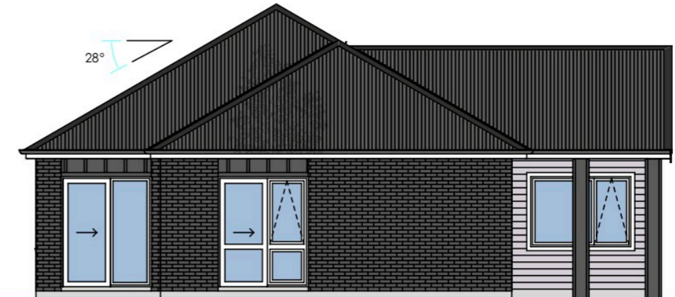
ELEVATION 4 (EASTERN)

H3.1 PLY BOARD & BATTEN CLADDING ON 20mm VENTED CAVITY SYSTEM (BATTENS @ 400 CRS)