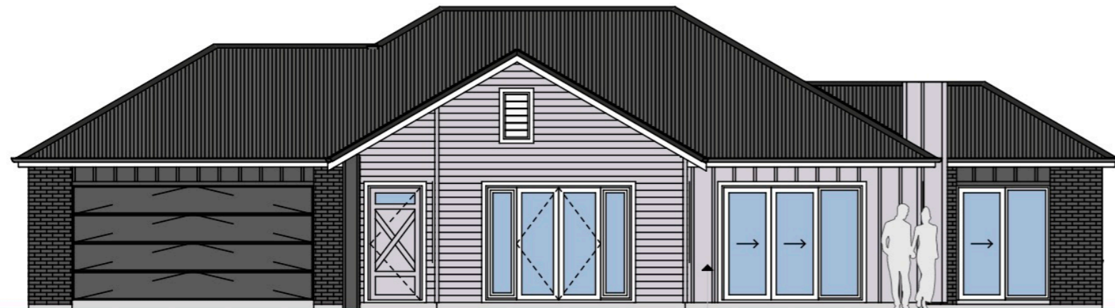
ELEVATION 3 (NORTHERN)

H3.1 TREATED PINE SHIPLAP WEATHERBOARDS WITH BATTENS AT 600mm CRS (PAINTED) ON 20mm VENTED CAVITY SYSTEM OVER H3.1 TIMBER CAVITY BATTENS