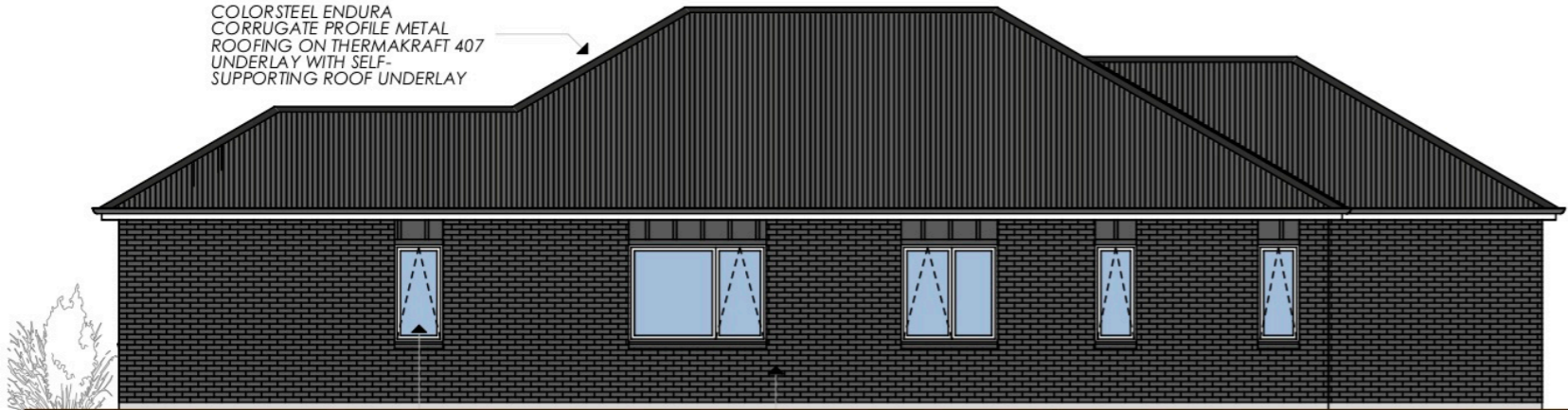
ELEVATION 1 (SOUTHERN)

COLORSTEEL ENDURA CORRUGATE PROFILE METAL ROOFING ON THERMAKRAFT 407 UNDERLAY WITH SELF- SUPPORTING ROOF UNDERLAY